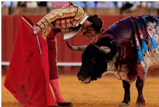
Spanish matador Juan Jose Padilla leans on a bull during a bullfight at The Maestranza bullring in Seville